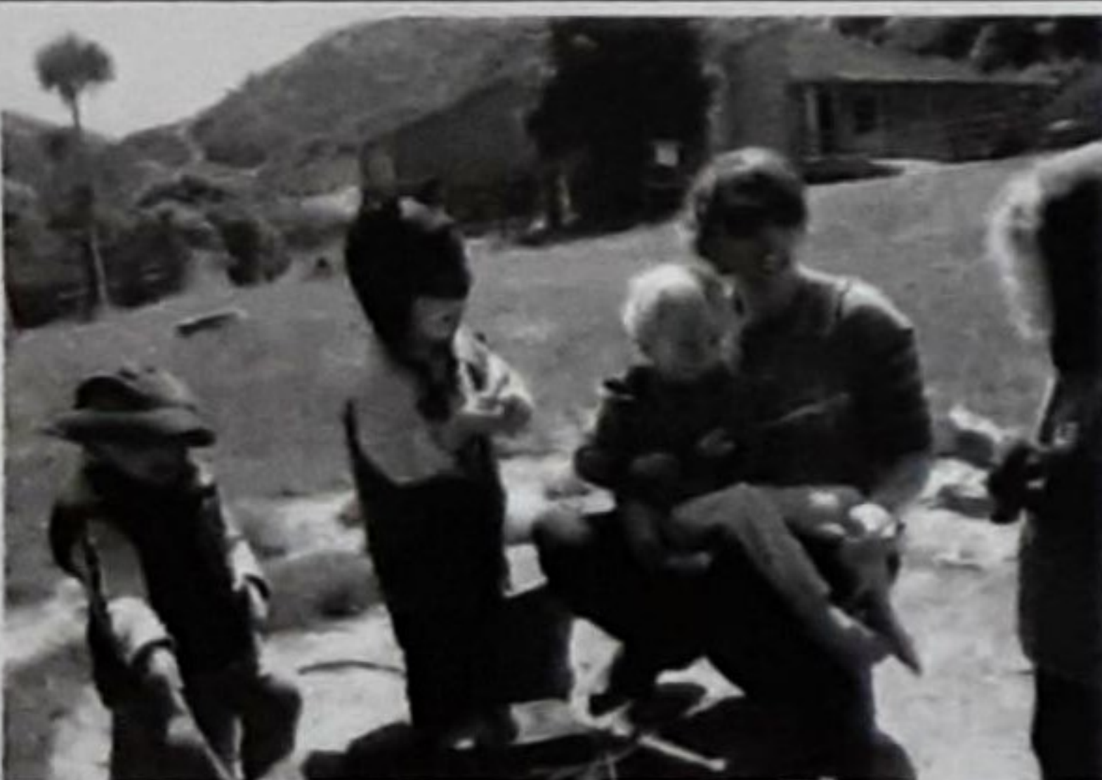
Normandale Playcentre goes bush