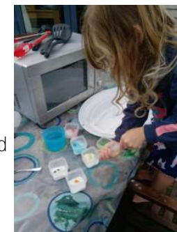
Enjoying messy play.