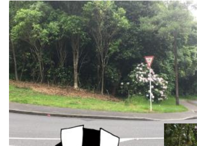
The recently planted seedlings at Normandale's entrance.

Over Labour weekend, we (Normandale Residents' Association) had our spring planting project, where native seedlings were planted at the entrance to Normandale. Many of them were planted up by the give way sign at the bottom of Normandale Rd. Cheers to everyone who lent a hand, and onto the next project to help beautify our neighbourhood.