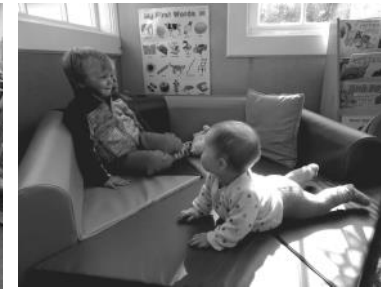
Some snaps of the new and improved playcentre.