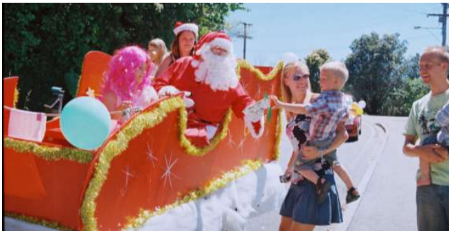
Bellow: Santa throwing lollies to the waiting crowds.