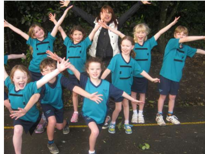
Normandale Star's Netball Team

Normandale School is also lucky enough to have a solar powered swimming pool where students have the benefit of extra swimming throughout term one and Year Five's and above have the opportunity to join a Waterpolo Team. We have great support and commitment from parents, past students and teachers who coach and manage the sports teams, with teachers and parents also initiating extra practice at lunchtimes.