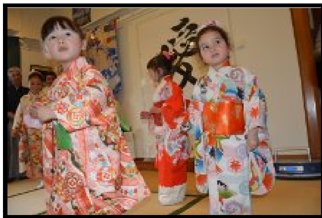
They might be young and cute but these girls from Koten Dance Group wowed their audience with their Japanese dance steps.

The next public events at Minoh House will be Meet the Tutors Day early in February and a Japan Martial Arts Expo in March.