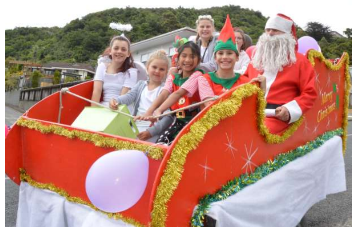
Santa and his entourage in Miromiro Road.