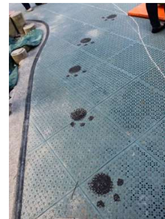
Follow the trail of bear paw prints