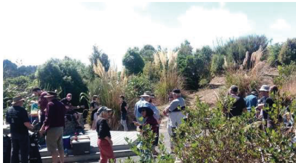
Photo to the right from the community BBQ