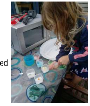
Enjoying messy play.