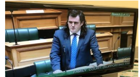
Hutt South's current representative, Chris Bishop