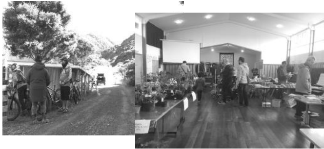
Some pics from last month's events; the St Aidan's garage sale, and the mountain biking event up at the Stratton St Woolshed.

Kia Ora Normandale! It's your Normandale Times editor here. I'd just like to say that I post stuff on our Facebook page (Residents of Normandale), which features some things you won't find in the newsletter if you want to take a look. As we wrap up 2020, it's been a real pleasure doing these monthly issues for you. Have a safe and happy holiday everyone.