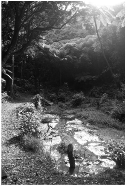
Pictured: state of the pond in Jubilee Park.

We didn't neglect issues around Normandale, especially water leaks and the state of the pond in Jubilee Park. The Mayor took note of our concerns and ideas, and promised to put us in touch with appropriate council officers to follow up on actions.