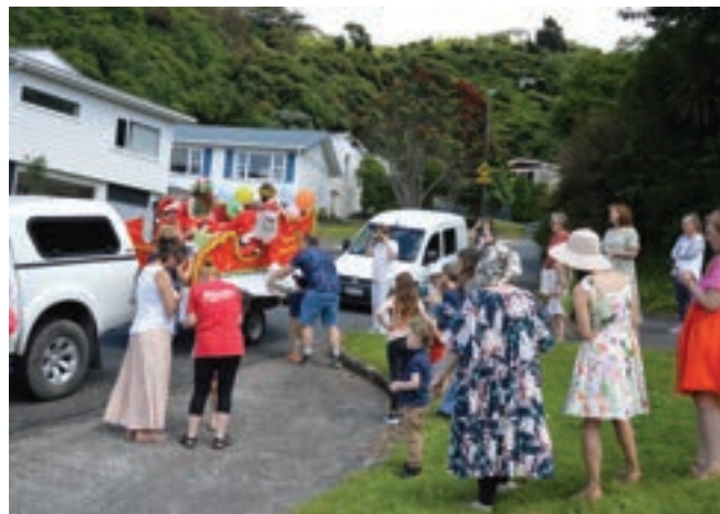
Another delivery by Santa, this time to residents of lower Miromiro Road who make the visit by the Man in Red part of their neighbourhood Christmas morning festivities.

A F N O R M A N D A L E I G C L Q T V W I X P Q R A Y U O N M U L B E R R Y T S G W R A S F R M D C O Z P Q X N O C L T K G D M Z M U A W Y A G K E J O M H S A I T O V Z K V C P O B X V E I R N S M L E N H O H U S L R C O T T L E P A R K N J P B C B R U I N B D E I O S I C O A A N Q V N F U Q S H W E Y S T D I P F O D O T T I A A H T E O X Y E S I H W I W Y Z O P E S W T B L M M Z N I J N K S W L Z A C I J K G A M H D E A S T V I E W F B X P E B S M B D F H J L M P Q R S T U M R W A T E R L O O H E L E N V K O U K O U W Y A C T A K A