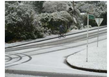
An intrepid cyclist on Pekanga Road

Not everything about the snow was good news; the media advised people to avoid travelling if at all possible. The weather forecasters were pointing to several days of full bore winter, and schools were poised with their fingers over the cancellation buttons.