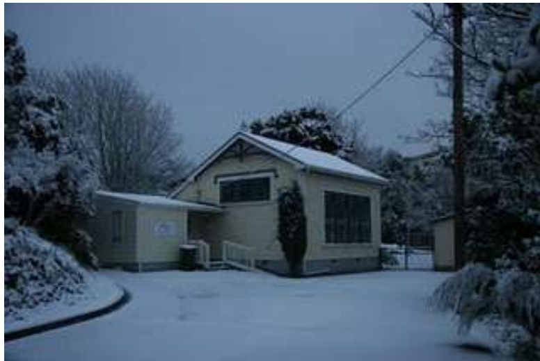
A photo from an ex Play Centre person

Normandale Playcentre who now use the building are planning a Centenary Celebration of the old school by organising an Open Day in November. They would like to invite residents to contact them if they have any ideas or old photographs or memorabilia to bring along for the day, these could be for uses of the building in any of the past one hundred years. Planning at this stage includes an old fashioned games day and re-enacting some of the celebration which occurred at the original ceremony, which included entertainment in the form of bagpipes and the dancing of a Highland Fling. If you would like to be involved or have ideas or comments, please leave a message for Lisa on the Playcentre phone and she will call you back, the number is 589 1227. More details in the next Normandale Times issue.