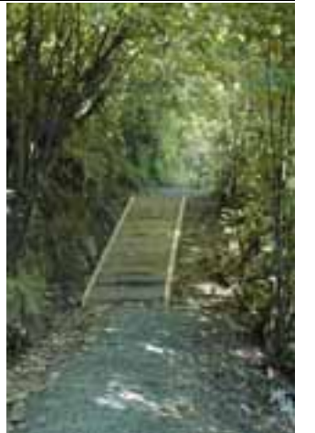
Stairway to heaven: the main access into Jubilee Park has been cleared and improved.

The grassy areas of the park were once the sites of grand homes which had driveways onto the Western Hutt Road. The houses and drives were acquired by the government so the road could be widened from two lanes to four in the 1960s.