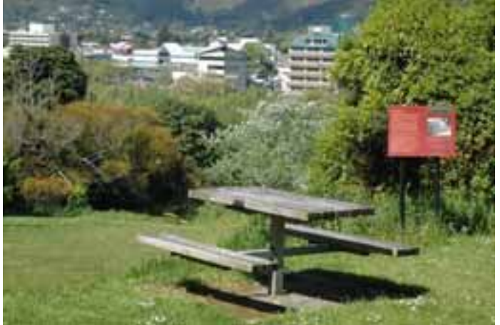
Picnic with a view: table and seats are provided, just bring your picnic. An interpretation sign explains the site was once the home of J D Climie, an early surveyor after whom Mt Climie in Upper Hutt is named.

The houses were demolished and later, surplus land was given to the city council and incorporated into Jubilee Park. Many trees and shrubs, including gums and rhododendrons, from the gardens remain. At each site is information, written by local historian Rosemary McLennan, about each house.