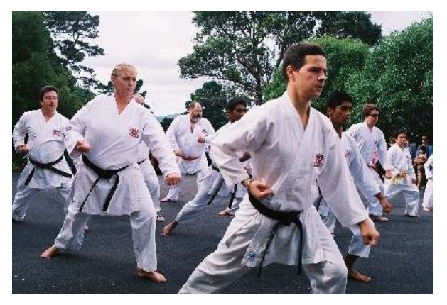
Members of the Wainuiomata-based Wellington Region Karate Academy demonstrate their skills.