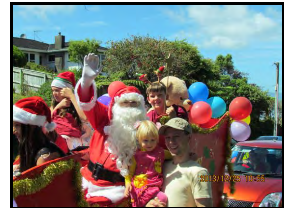
Santa arrives in Christina Grove